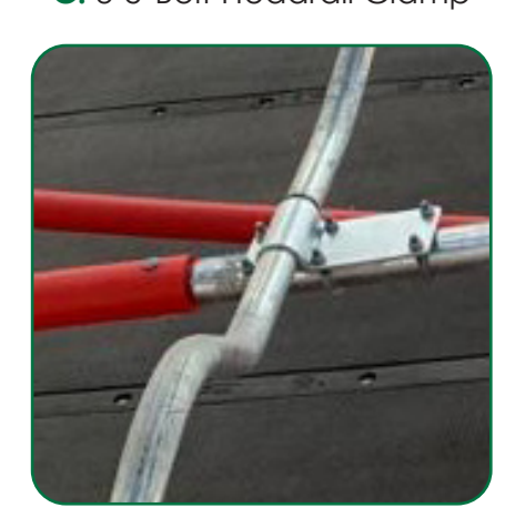
C. 3 U-Bolt Headrail Clamp

<u>Step 5:</u> Connect zig-zag neck rail to walls at bed ends using Headrail end Brackets.